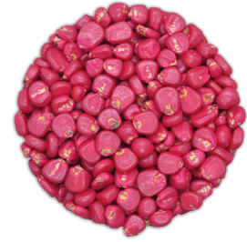
Disco Pink L-1606 + Imidacloprid 48% FS