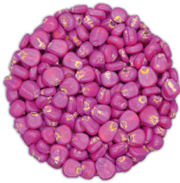
Disco Pink L-1606 + Thiram 75% WS

Pictures below show the results of coating with Disco Pink L-1606 in combination with different a.i.'s