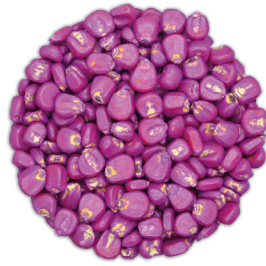
Disco Pink L-1606 + Metalaxyl 35% WS