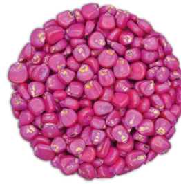
Disco Pink L-1606 + Thiamethoxam 30% FS