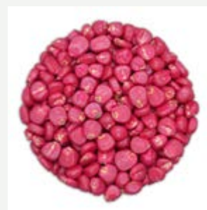
Disco Pink L-1606 + Imidacloprid 48% FS