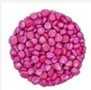
Disco Pink L-1606 + Thiamethoxam 30% FS

The four pictures show the visual results of coating with Disco Pink L-1606 in combination with different active ingredients.