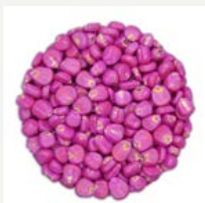
Disco Pink L-1606 + Thiram 75% WS

This graph shows the abrasion values of the film coat layer on the seeds. Lower abrasion means higher abrasion resistance; the ability to withstand mechanical wear or surface damage caused by friction during processing, packaging, handling and sowing.