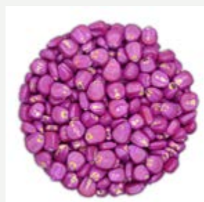
Disco Pink L-1606 + Metalaxyl 35% WS