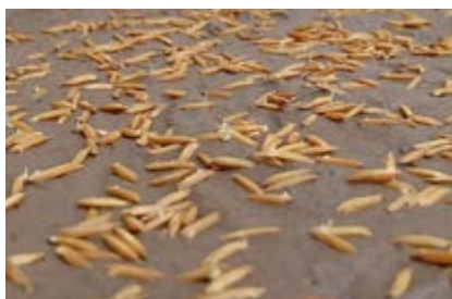
Rice seed film coated with Disco L-1902