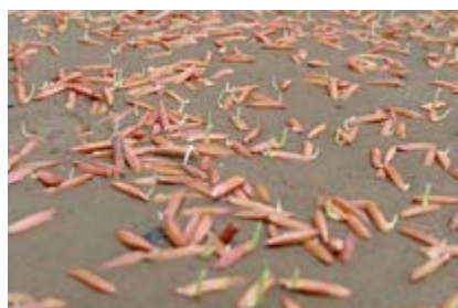
Rice seed film coated with Disco 2.0 Rice