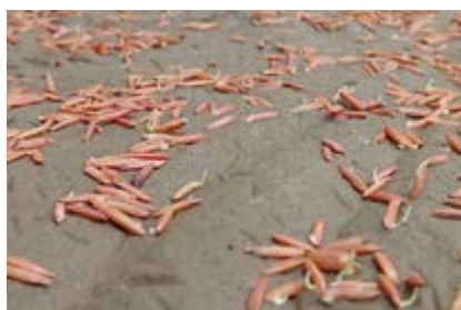
Rice seed film coated with Disco Plus Rice