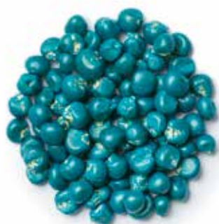
A treatment with L-950 results in attractive, turquoise-coloured seeds.

Results confirm that the L-950 has improved wet and dry flowability, providing faster and trouble-free transportation of the seeds throughout the entire process: in the facility and in the field.